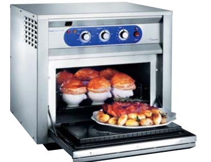
Merrychef - RD501