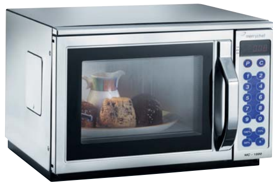
Merrychef - MD1800