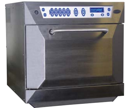
Merrychef - 402S