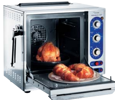
Merrychef - RD401