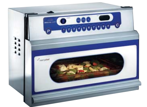
Merrychef - HD2025