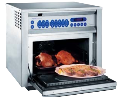
Merrychef - EC501

Work with our chefs to find the perfect mix of power for each menu item. With the 400 and 500 series, you can choose from up to 10 programmes including multi-stage programming (up to three stages per programme).