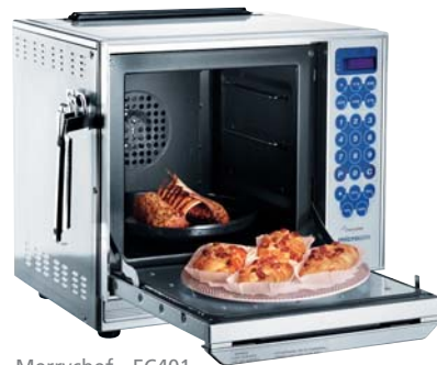
Merrychef - EC401