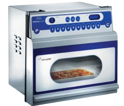
Merrychef - HD1025